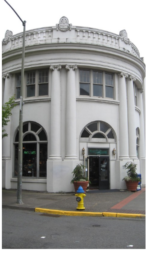
Coos Bay National Bank Building, often referred to as "Bugge Bank". 1923 National Register